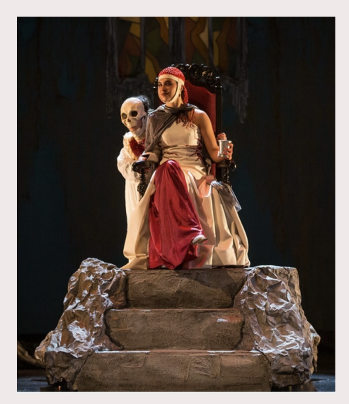
"Lady M. showed me what I'm capable of."

"Lady Macbeth was a dream come true. That role is about the fervor of survival. I really put myself in the circumstances of being a woman with status in 11th century Scotland. Lady M. is ruthless because she has to be. Working from that place, being given permission to turn up the volume on the parts of myself that regularly don't see the light of day was the ultimate acting exercise."