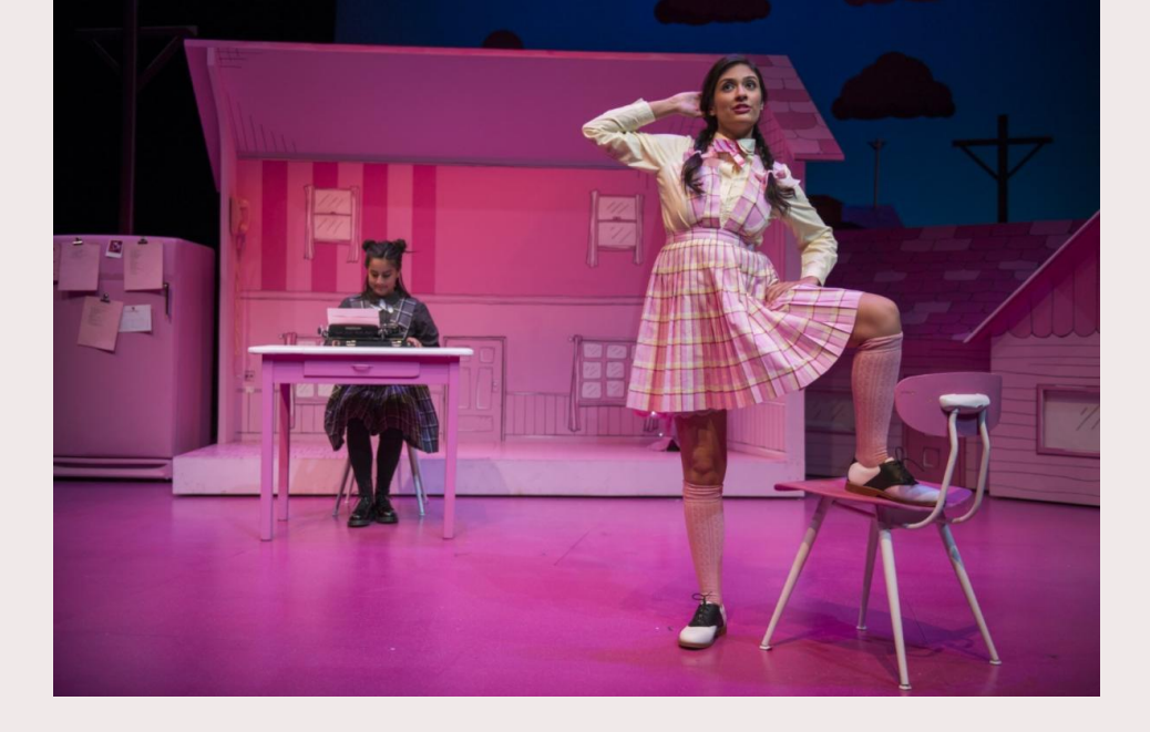
The Women Eat Chocolate by Caroline Macon